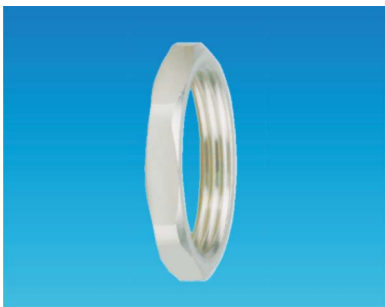
Material : Copper

Explain C means material Copper N means Nut